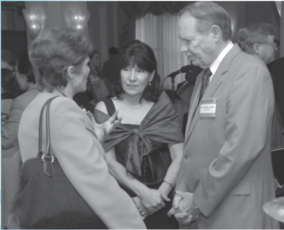
Presentations at the International Leadership Conferences sparked lively discussion.

“Christian religious leaders came up to me with smiles on their faces. They said, ‘You know, this is the first time we have ever been heard.’”