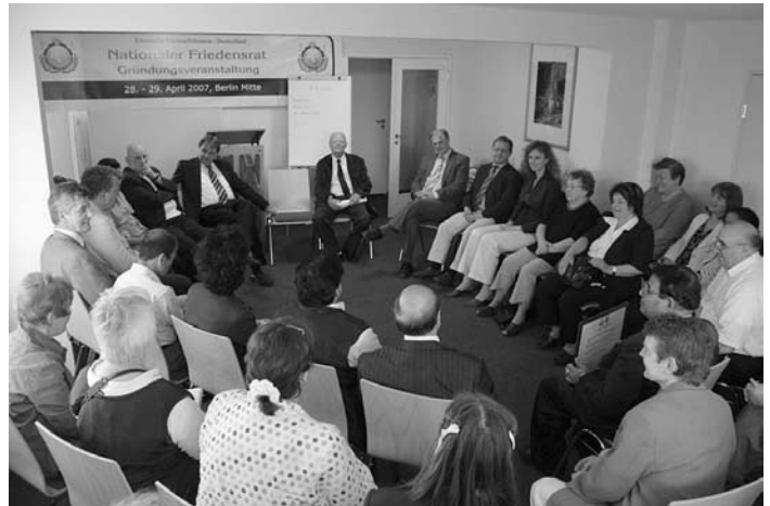
German Peace Council

The working groups met to set goals, and lively discussion continued into the night.