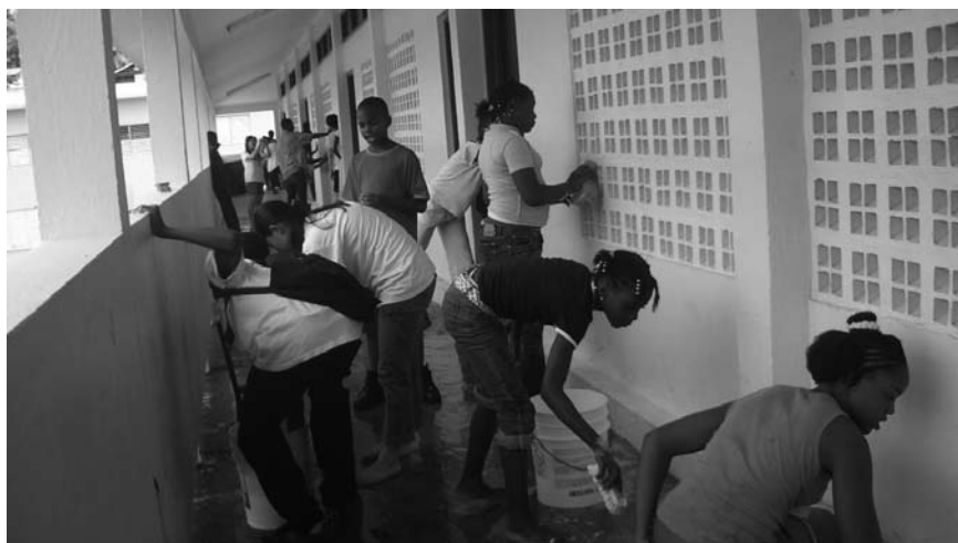
Students clean a school in St. Lucia