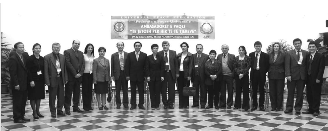
Albania Peace Council

This culture of peace is being promoted on a grass-roots level through peace councils in each of Benin’s twelve departments.