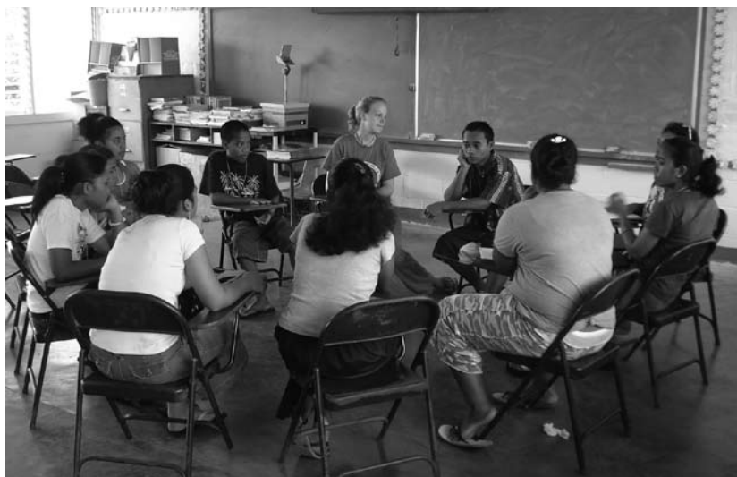
Discussion group during summer camp in Pohnpei, Micronesia

was especially happy to see his school thoroughly cleaned.