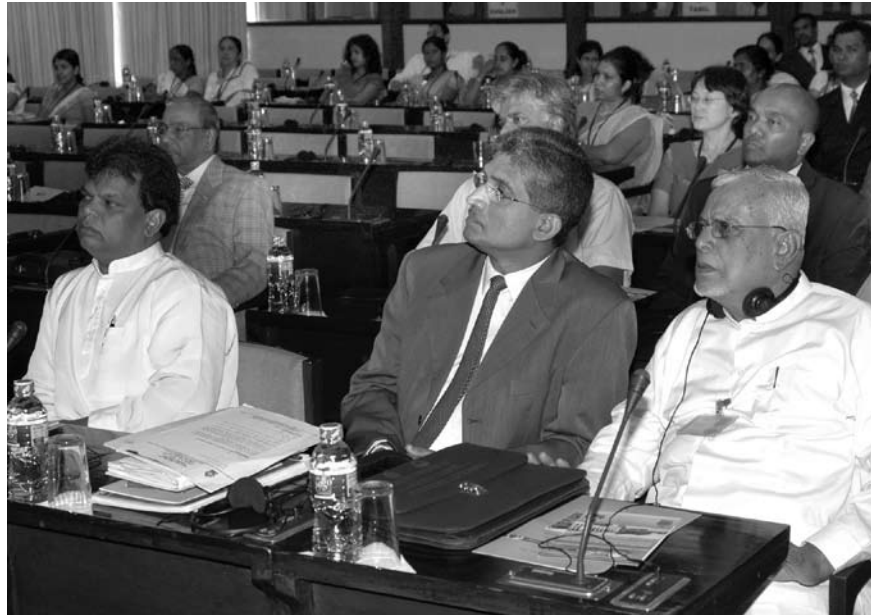
Members of Parliament in the audience

In summary, the conference provided a unique forum for cooperation between government and civil society. Discussions focused on responsibilities