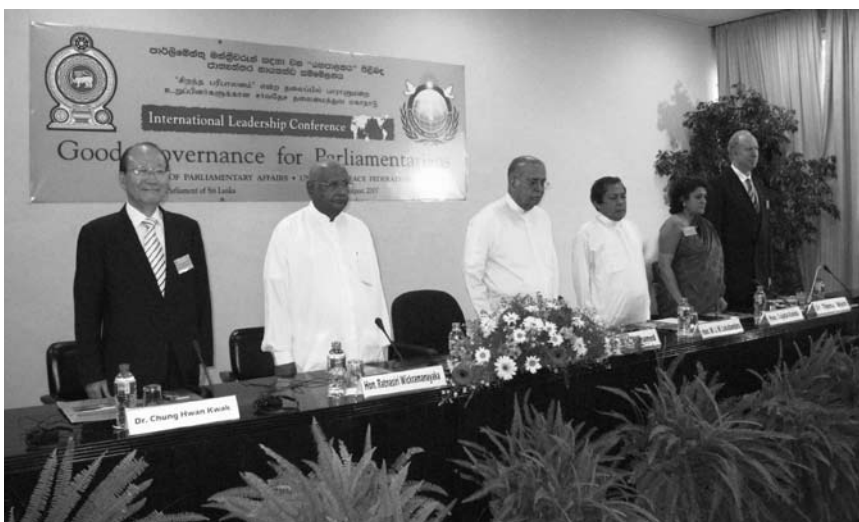
Panel presenters at the International Leadership Conference in Sri Lanka