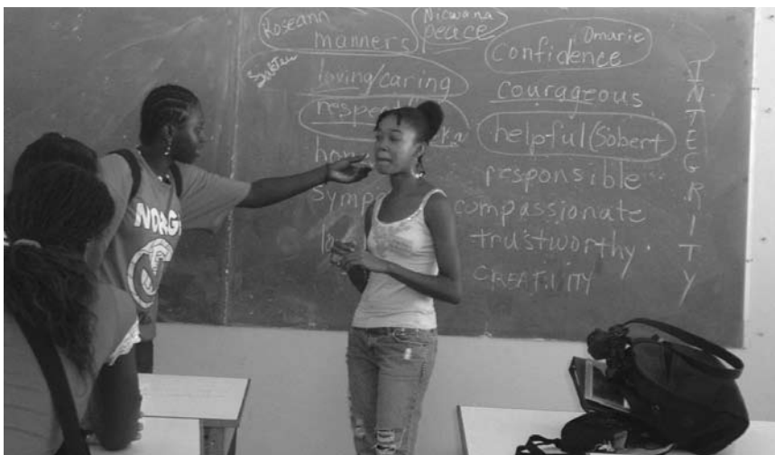
Students in St. Vincent participate in an exercise from the Discovering the Real Me curriculum.