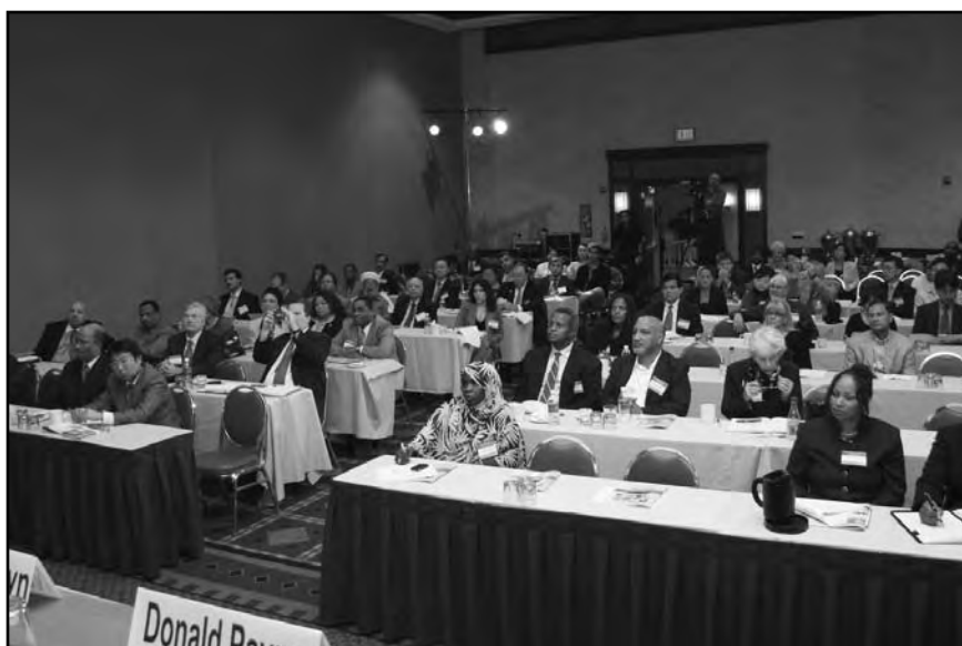
Audience at the US-UN Symposium