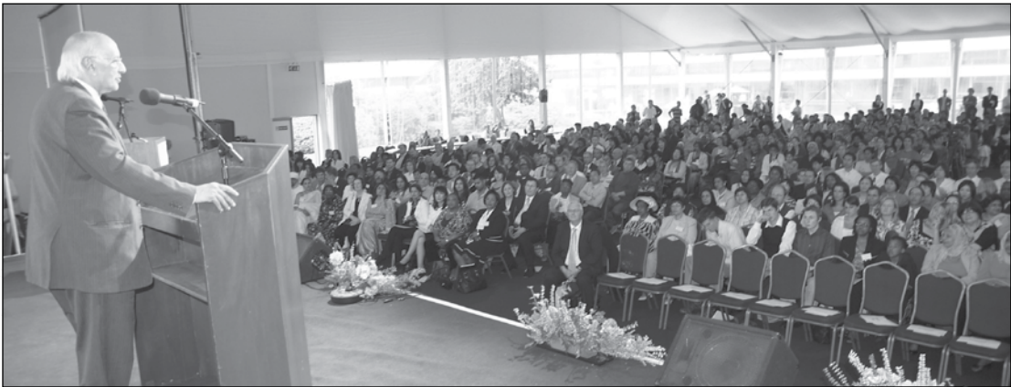
Lord Tarsem King