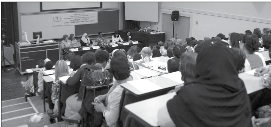
Conference on Gender Equality.