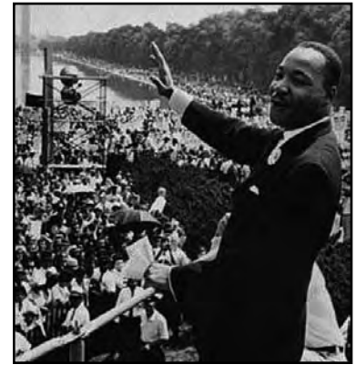
Dr. Martin Luther King, Jr.