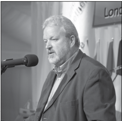
David Anderson, MP