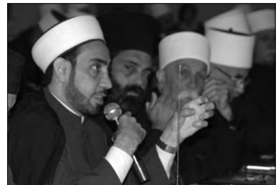
Many of the delegates were eager to ask questions and share their views.

Between sessions there were opportunities for discussion. Many of the delegates were eager to ask