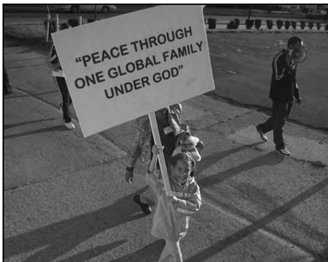
A girl carries a sign during a peace march on the International Day of Peace in Michigan, US.