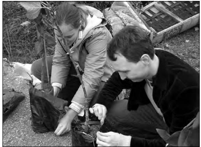
Israeli and Arab youth work together planting trees during a Global Peacemakers Project.