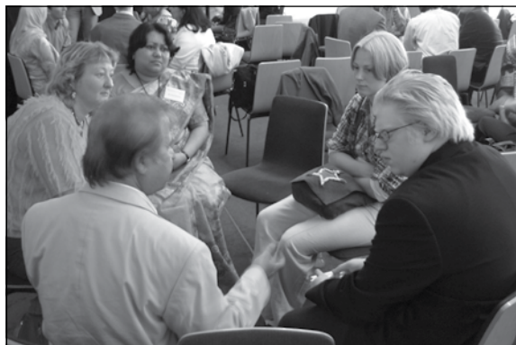
In discussion groups, participants explored ways to share their values.

The Sant Nirankari Mission, an all-embracing spiritual movement dedicated to human welfare, was one of eight partner organizations participating in the Global Peace Festival in London.