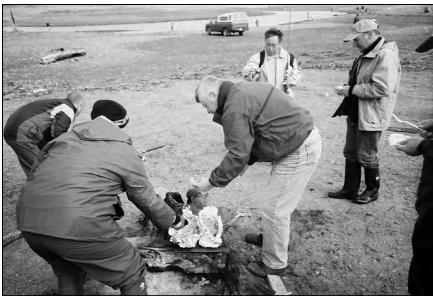
A few people caught some salmon, one of which we cooked fresh right out of the river, which made for a delicious lunch.