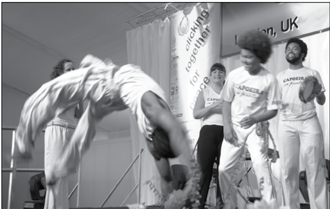
Capoeira, Brazilian martial arts dance