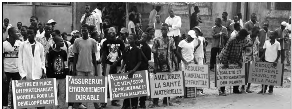
Posters raise awareness of the UN's Millennium Development Goals during the Global Peace Festival in Benin, Africa.

In recent years, democracy has begun to spread in Africa. Nigeria has enjoyed over eight years of uninterrupted civilian, democratic rule. Yet, religious and ethnic tensions continue throughout the continent, and growing disparity in economic structures between the haves and have-nots has heightened tensions between economic classes in Africa.